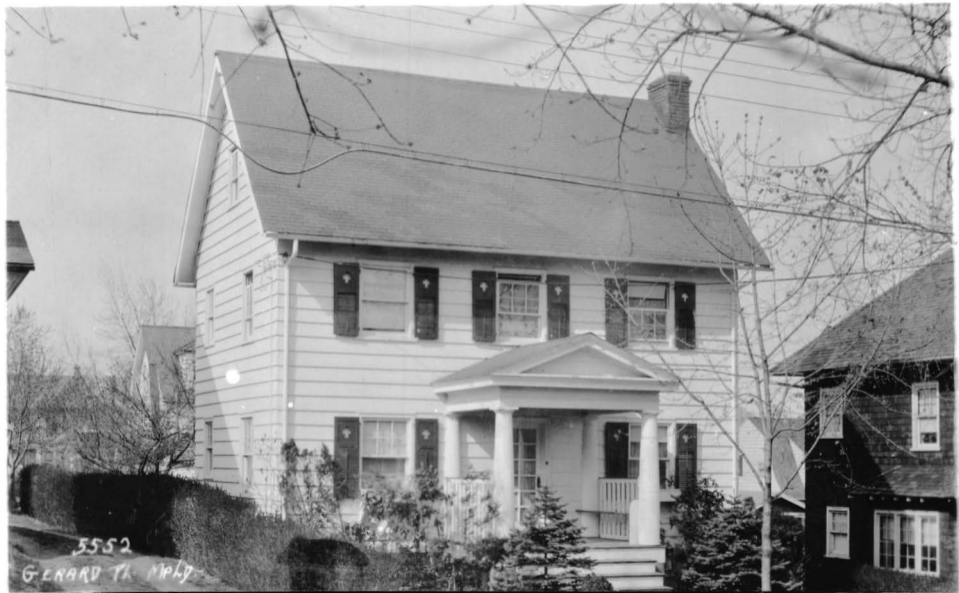
BOARD OF REALTORS of the ORANGE & BERKELEY