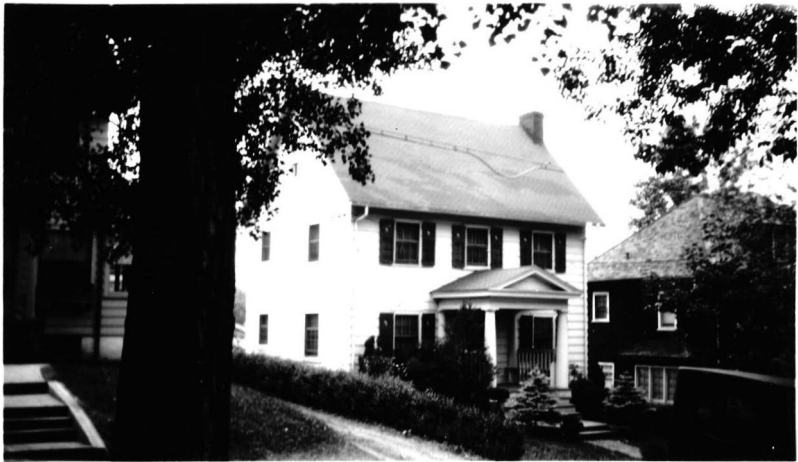
#8 Girard Pl.